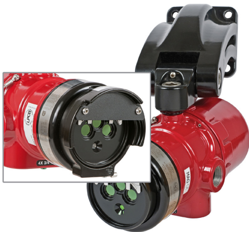
Figure 1: Heavy wind, rain or snow can lead to weather-induced fault conditions for flame detectors because infrared radiation is absorbed by water molecules. To minimize the accumulation of moisture or condensation on detector optics, look for IR detectors with lens heaters and device shielding (as shown on the Det-Tronics X3301 Multispectrum IR detector above).

Installation techniques can also help minimize the impact of precipitation on optical flame detector performance. Since detectors usually monitor processes at or below their level, users can aim detectors down 10–20 degrees.